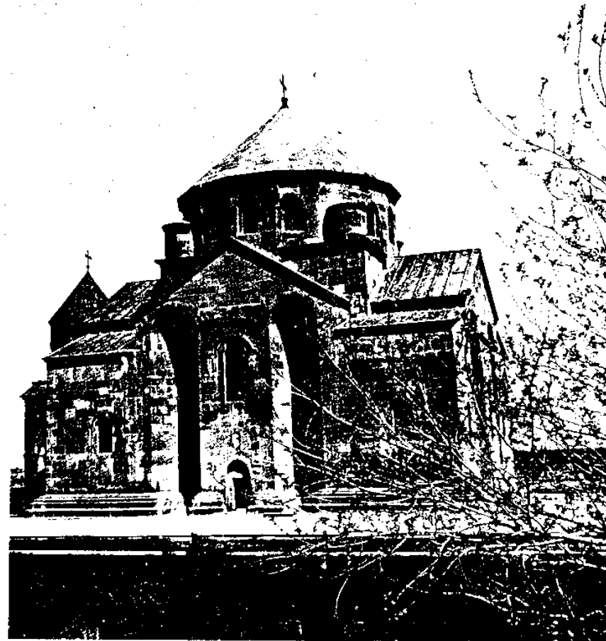
Հոփիսիսնի տաճարը (Յ18 թ.):

Mass will be celebrated as usual on Sunday June 26.